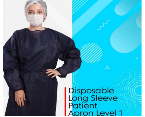
Disposable Long Sleeve Patient Apron Level 1