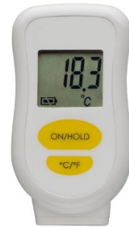
TFA 31.1034 Mini-K thermocouple