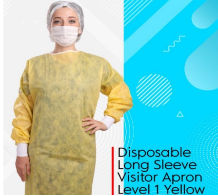
Disposable Long Sleeve Visitor Apron Level 1 Yellow