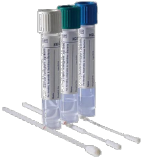
Virüs Transport Media + SWAB