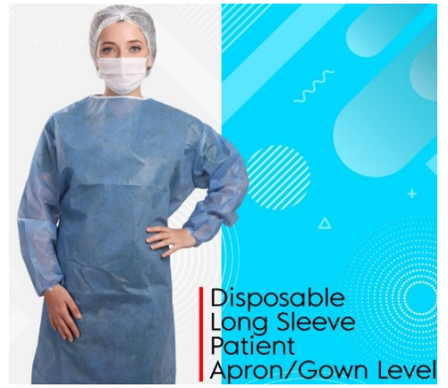
Disposable Long Sleeve Patient Apron/Gown Level