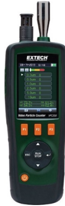
Extech VPC300 Particle Counter self-camera