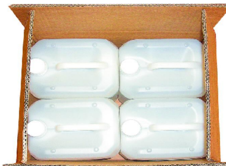
Methanol Concentrated Alcohol %96-99 5 LT