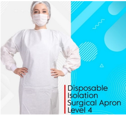
Disposable Isolation Surgical Apron Level 4