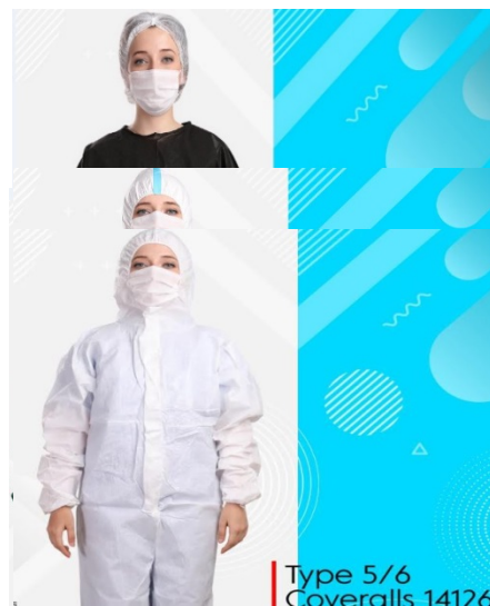
Type 5/6 Coveralls 14126