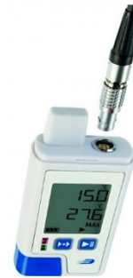
LOG200E PDF- data logger with display for temperature internally and external PT100 probe