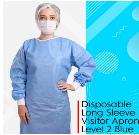
Disposable Long Sleeve Visitor Apron Level 2 Blue