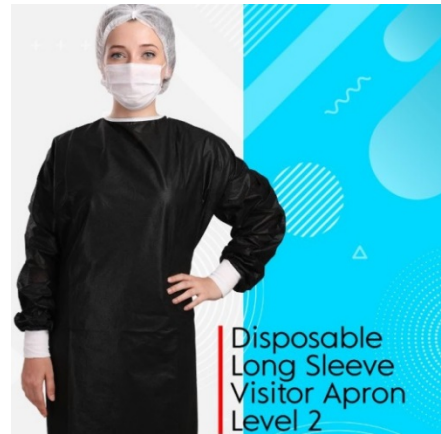
Disposable Long Sleeve Visitor Apron Level 2