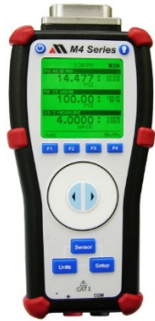
Meriam M4 Hand-held Calibrator / Datalogger